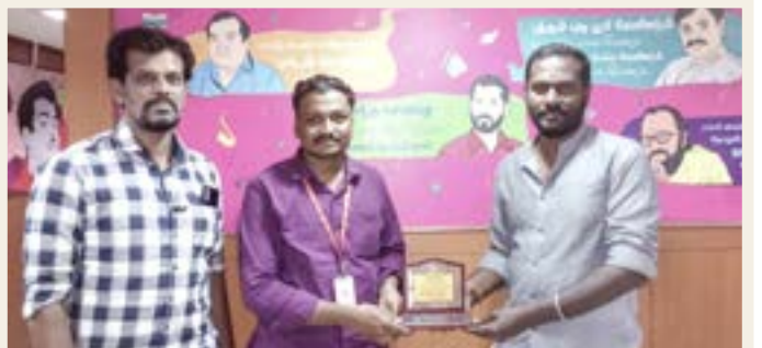
On behalf of M/S. Suryan FM 93.5 - Madurai.