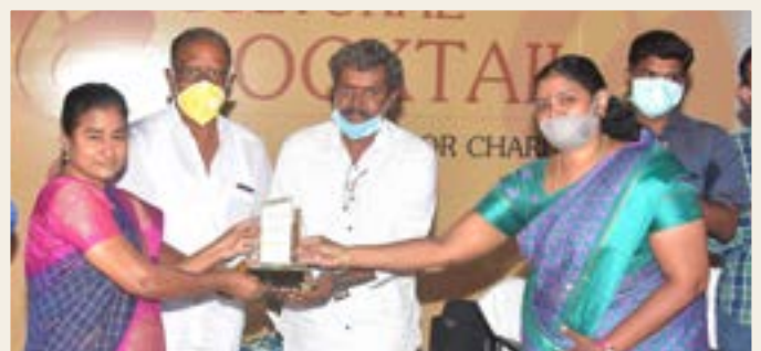
M/S. Mangayarkarasi College of Arts & Science for Women, Madurai.