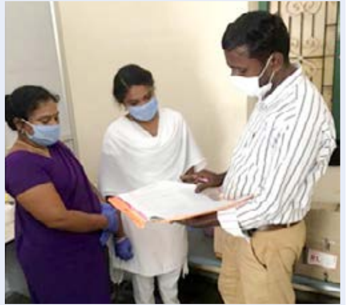
Chennai Pulicot Direct Relief - Sub Centre Visit.