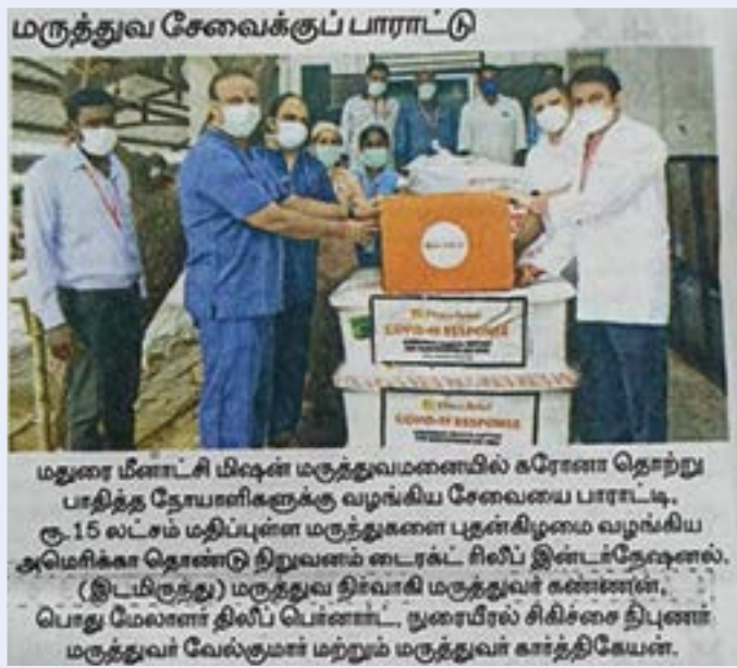
Received medicines from Direct Relief International worth of Rs. 15 Lakh.