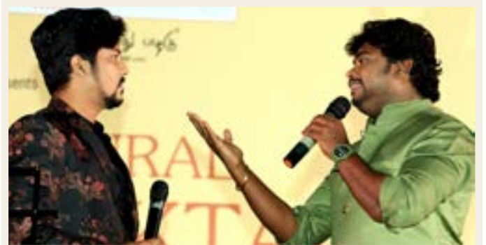
Stand up Comedy