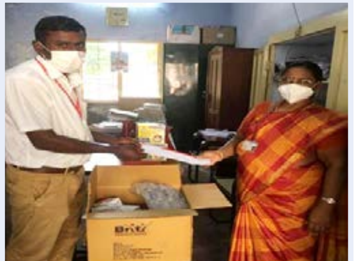
Medicine Distribution to Tuticorin Govt. Hospital.