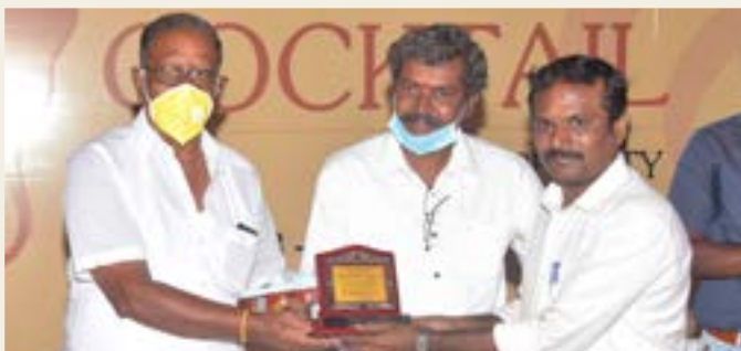
On behalf of M/S. Dinamalar, Madurai.