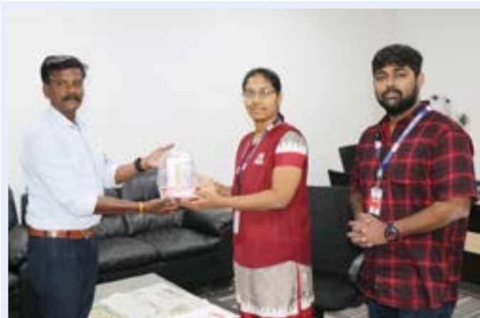
On behalf of Manu Neethi Foundation, Coimbatore.