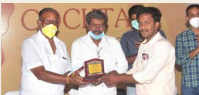
M/S. Namma Madurai & NM Digital Ads, Madurai.