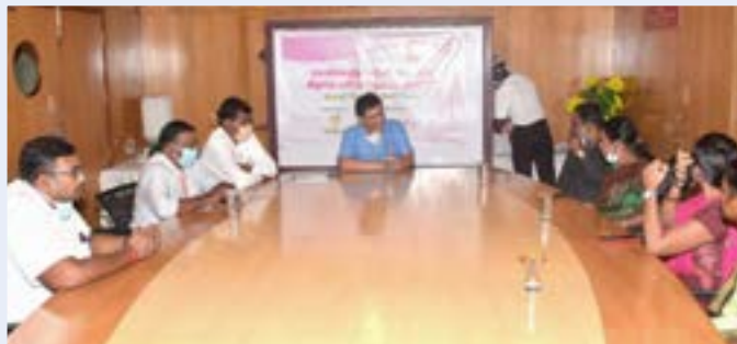
Redington Foundation free Cancer Deduction Camp Felicitation Ceremony.