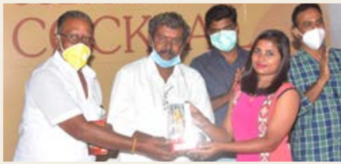
M/S. Naturals Saloon & Spa - K.Pudur, Madurai.