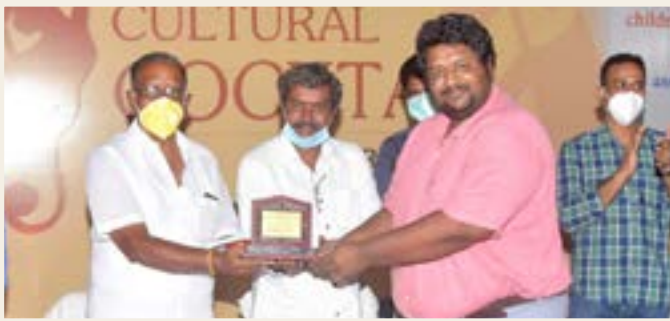
On behalf M/S. Subhulakshmi Lakshmiathy College, Madurai.