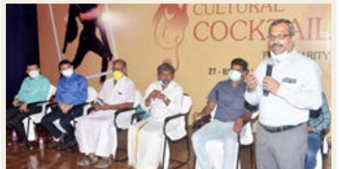
Thank You Note