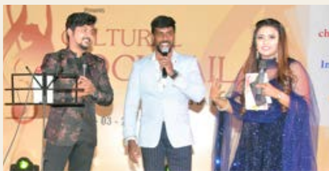
Show Kick off