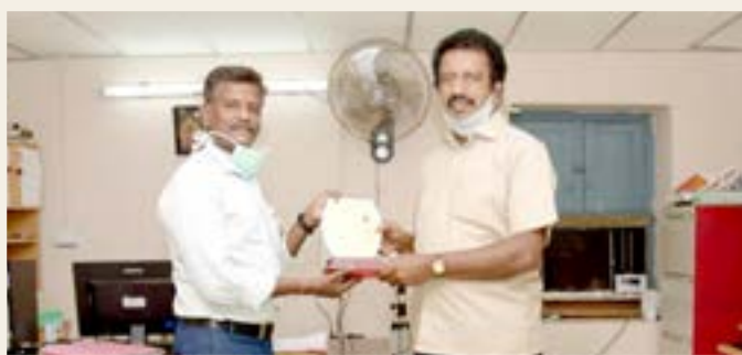
Onbehalf of Gandhigram Rural Institute, Gandhigram