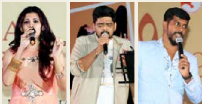
Cocktail singing folks western & more!!