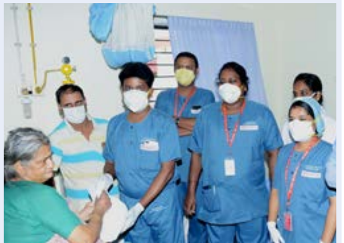
Dept. of Physiotherapy, MMHRC, Madurai.