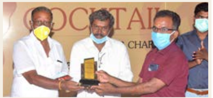
M/S. Tamilnadu Agricultural University, Madurai.