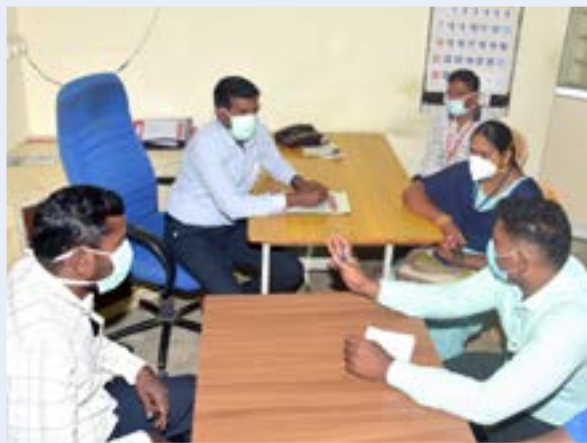
Official Meeting with RNTCP state coordinator, Madurai.