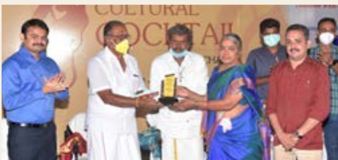
On behalf of Sri Sathguru sangeetha Vidyalayam College of Music, Madurai.